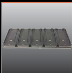
SnapBack Battery Charger