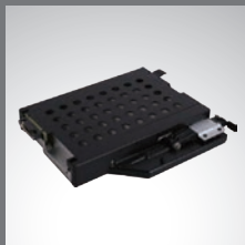
Multimedia bay 2 nd storage