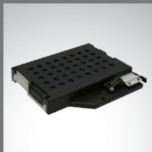
Multimedia bay 2 nd battery