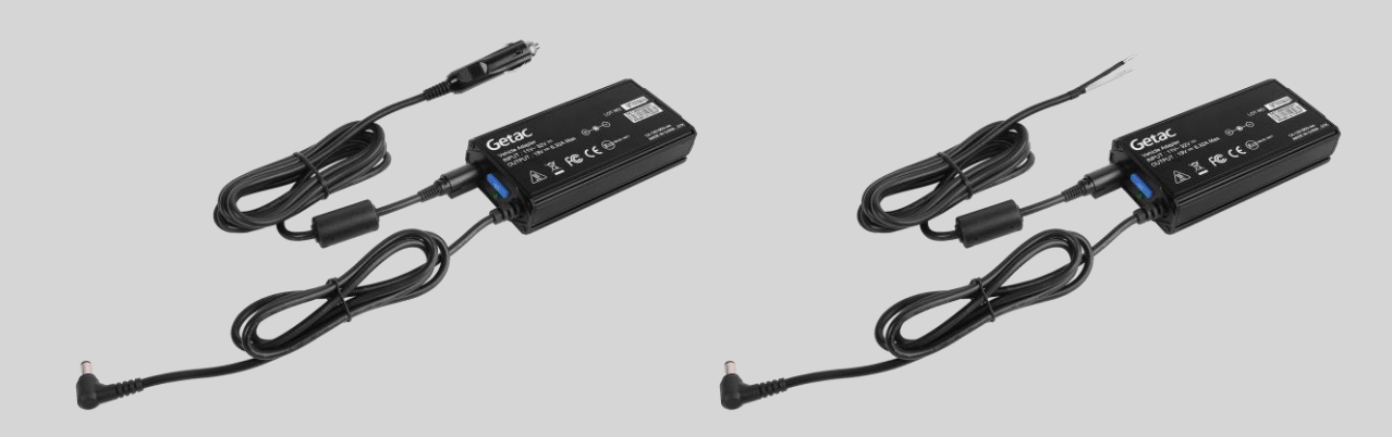
Cigarette Lighter Plug Version

(Cigarette Lighter Plug Version) GAD2X8 (Bare Wire Version)