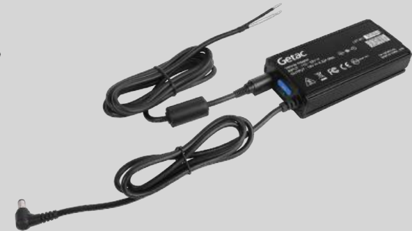
Bare Wire Version