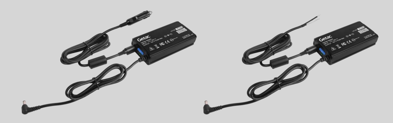
Cigarette Lighter Plug Version

(Cigarette Lighter Plug Version) GAD2X8 (Bare Wire Version)