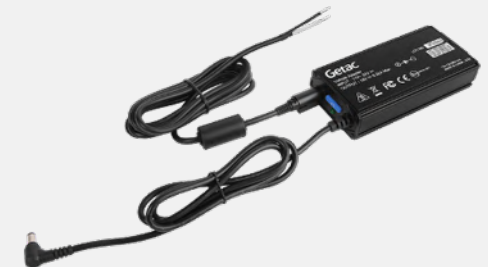
Bare Wire Version