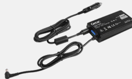
Cigarette Lighter Plug Version