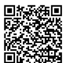
X600 3D demo