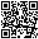
UX10 3D demo